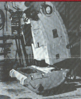
Readying sections for re-alignment and repair ▲

A DEFINITE OVERLOAD CAUSED THIS PRESS FRAME TO PART COMPANY - NOT MERELY CRACK!